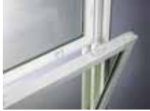
Sash tilts in for easy cleaning